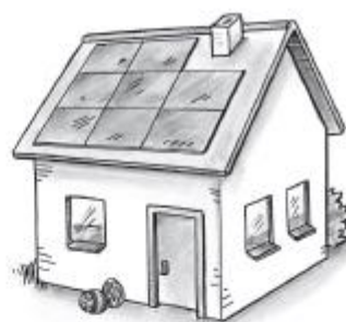
The Easter eggs