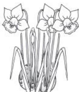
The Easter eggs