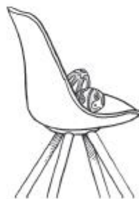
The Easter eggs