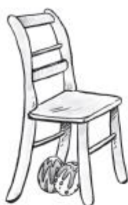
The Easter eggs