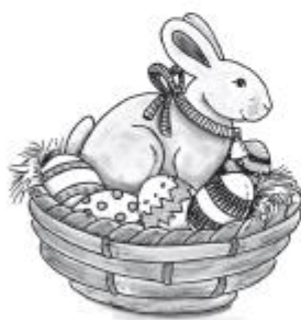
The Easter eggs

on – in front of – under – in – next to – behind