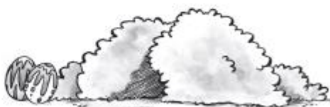
The Easter eggs